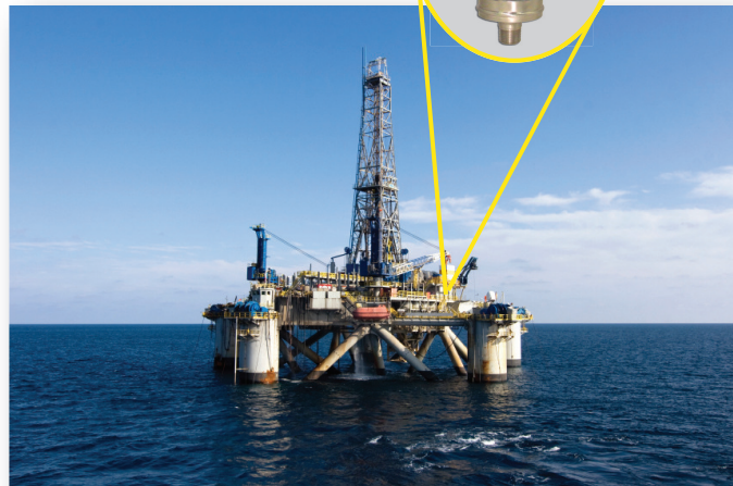
REOTEMP vs. Competition: Performance evaluation for Abkatun-Pol-Chuc Rig