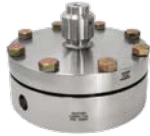
High Accuracy Offline