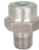
Threaded Flush Face