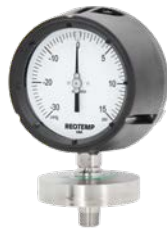
High Accuracy Seal Gauge