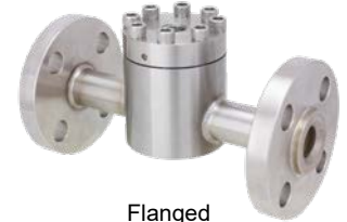
Flanged Flow Thru