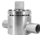
Welded Pipe Flow Thru