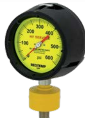
Acid Safety Gauge