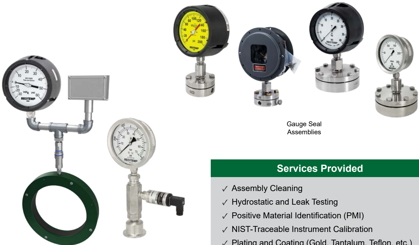
Gauge Seal Assemblies