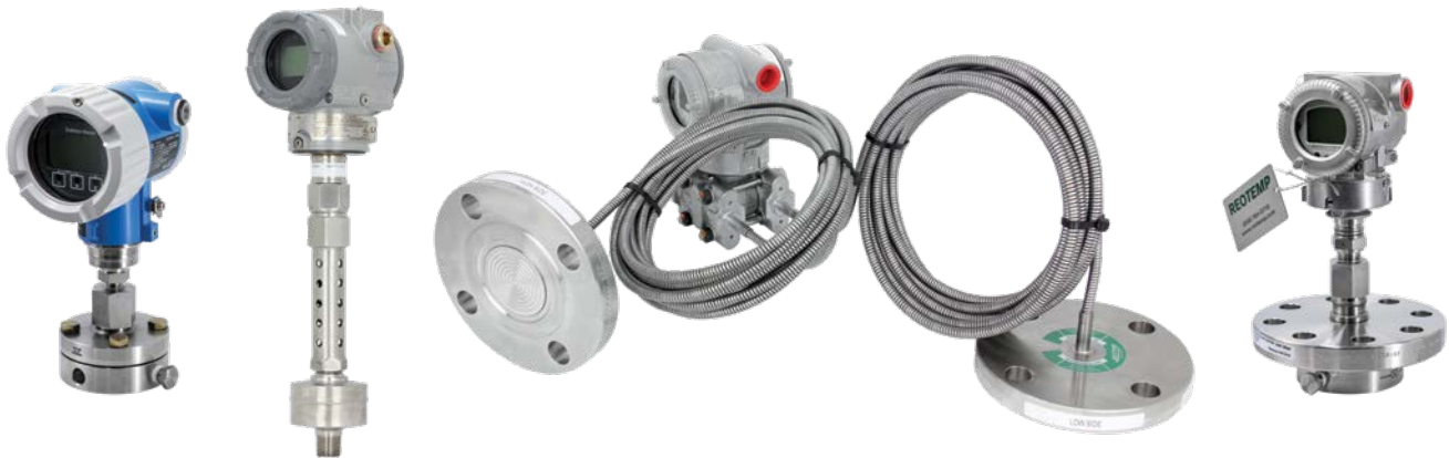
Smart Transmitter Assemblies