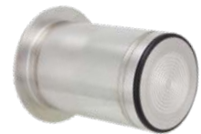
Sanitary Tank Spud