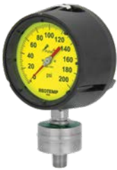
Process Seal Gauge