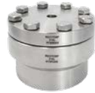
Saddle Mount Seal