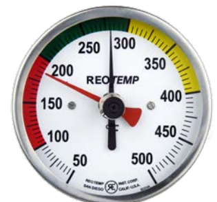
Min-Max Pointer with Color Bands